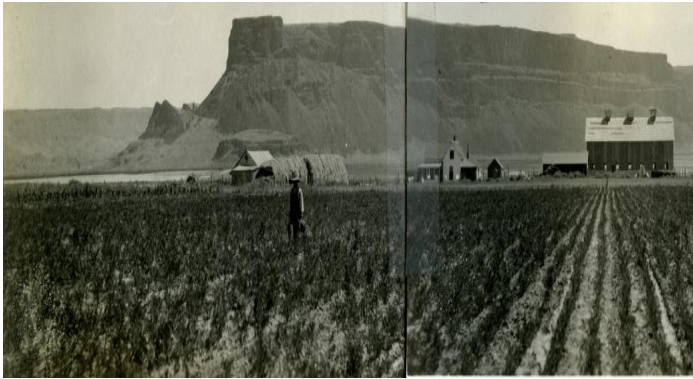
circa early 20 th century