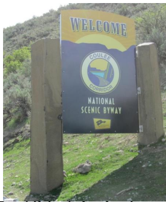
Established sign in place along SR155

The sign project was part of a $200,000 National Scenic Byways 2003 grant that included installation of two signs, at the north end and south end of the Coulee Corridor at Omak and Othello, 40 signs identifying the Coulee Corridor on SR 17, SR 155 and US 2, and interpretive signage at a new ¼ mile trail and restroom facilities near Lake Lenore along the shoreline at Alkali Lake on SR 17.