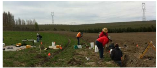
Mammoth dig is in a field in the Frenchman Hills