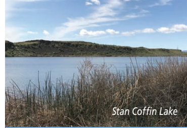
Stan Coffin Lake