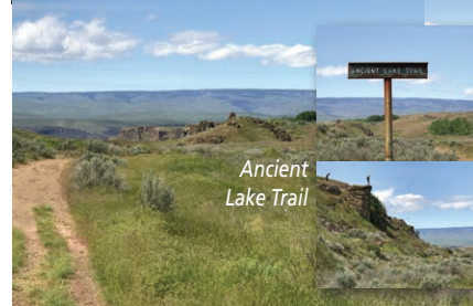
Ancient Lake Trail